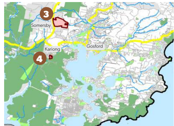
Map 2. Somersby (3) and Kariong (4) sites

Image right: Aerial image of a residential area