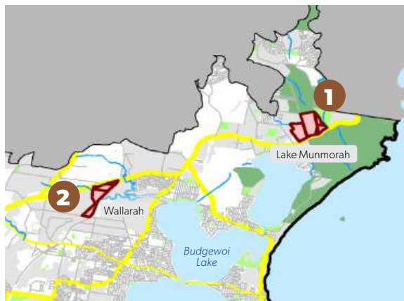
Map 1. Lake Munmorah (1) and Wallarah (2) sites